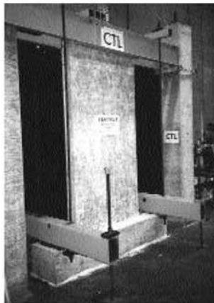
Flat ICF Wall

One wall specimen for each of five types of exterior residential wall systems were tested, each 8 feet high and 4 feet wide. Three of the wall specimens were built with ICFs, creating one flat concrete wall, a waffle grid concrete wall, and a screen grid concrete wall, all shown below. The walls were reinforced with grade 60 steel rebars. Additional steel extended from the top of the footing into each wall. The nominal compressive strength of the concrete used in the wall panels was 2500 psi. No finishes were applied to the surfaces of the wall specimens. Loads were applied to a concrete beam secured to the top of the wall panels with high strength anchor bolts to transfer the lateral forces to the top of the specimens. The foam plastic formwork was removed from one side of each panel to permit the performance of the concrete to be observed.