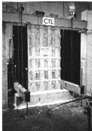
Waffle Grid ICF Wall